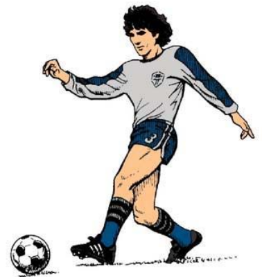
MEN'S & WOMEN'S SOCCER