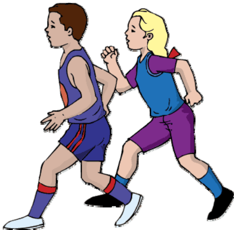
MEN'S AND WOMEN'S CROSS COUNTRY TRACK